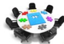
Parish Pastoral Council