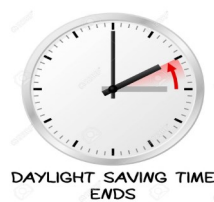
DAYLIGHT SAVING TIME ENDS

DAYLIGHT SAVINGS ENDS. Don't forget to turn your clock BACK one hour next week when you go to bed on Saturday night 1st April.